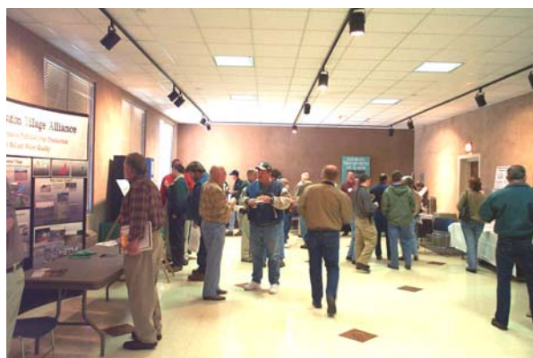
Attendees taking a break in the exhibit display area at South Georgia College in Douglas.